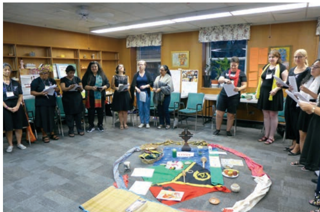
WDPIC Executive Committee

Committee, ensure the production of WDP materials, budget revision, implementation of recommendations and to be in communication with the National/Regional Committees (WDPIC