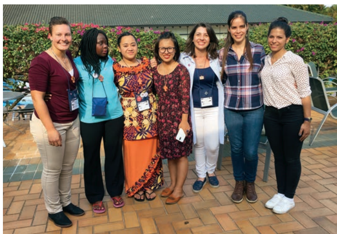
Young women at the WDP 2017 International Meeting.