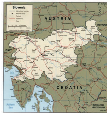
World Day of Prayer Writing Committee, Slovenia