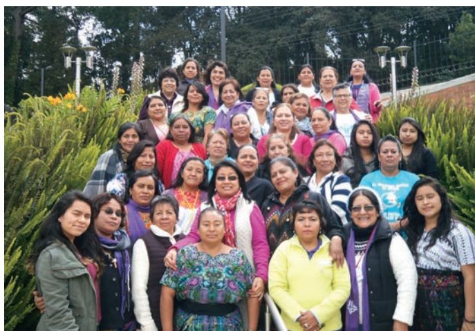
SNC 2017 workshop, Costa Rica, Guatemala, El Salvador

good leader prepares new leadership to take on the challenges.” Africa dreams of building a strong generation of young women to hold up the mantle of WDP. Moumita Biswas and Vino Schubert shared concerns for some WDP Committees in Asia that are dysfunctional. The political context of the region has increased violence against women and created obstacles to access information. They dream of facilitating access to WDP materials, promoting campaigns like Thursday in Black and nurturing children and youth into the future of WDP.