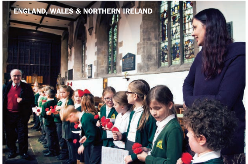
ENGLAND, WALES & NORTHERN IRELAND

Facebook: Svjetski molitveni dan Hrvatska - World day of prayer Croatia