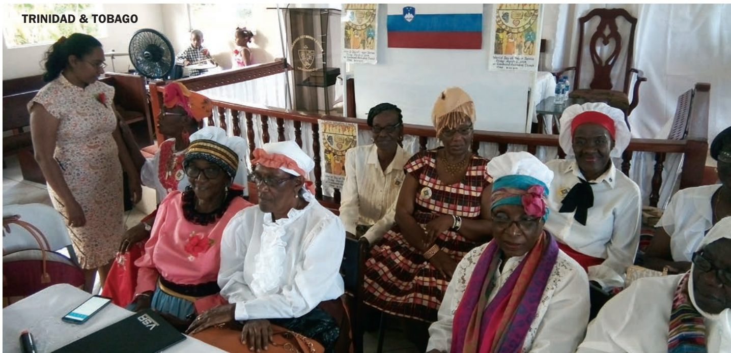
TRINIDAD & TOBAGO

participating. Five schools held the children's program and we were happy to get the children involved. The atmosphere was very joyous as we had also just celebrated our 40th independence day. The theme and Bible story delivered an appropriate and meaningful message. It challenged us to remember that in life anything can be justified but not everything is just, fair, and worthy in the eyes of God. We must take care of the priorities of God before anything else turns the direction of our lives on another direction.