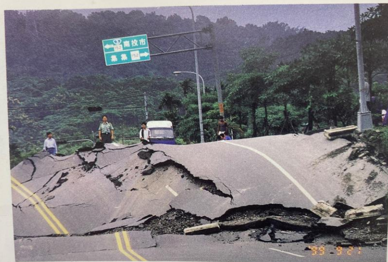
照片 5 南投縣名間鄉臺三線與投一五二號道路交叉口地面隆起情形。 (交通部國道新建工程局第五區工程處提供 88.9.21 攝)

[地震速報 Quake Alert]09/30 12:37左右東北地區發生中型有感地震，慎防強烈搖晃，氣象局。Beware of probable shaking. CWB