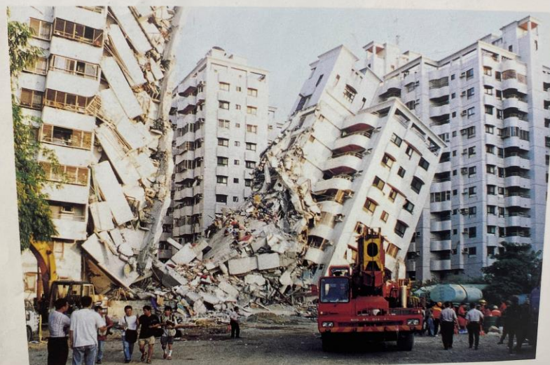
照片 30 臺中大里「金巴黎大樓」倒塌情形。 (行政院新聞局古金堂攝 88.9.23)