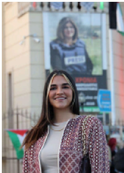
Lareen Abu Akleh Field and Communication officer Sabeel Jerusalem

What is specific for a peace work based on Jesus and his message of peace? Theological in-depth study and what it means in practice today in our local context.